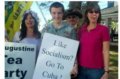
Plaza 1-28-2012

I predict future happiness for Americans if they can prevent the government from wasting the labors of the people under the pretense of taking care of them. Thomas Jefferson