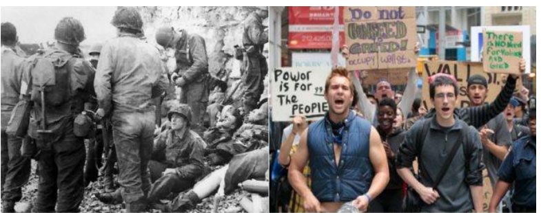
20 Years Olds in 1944 Giving Everything