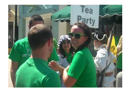
It's the wearing of the green