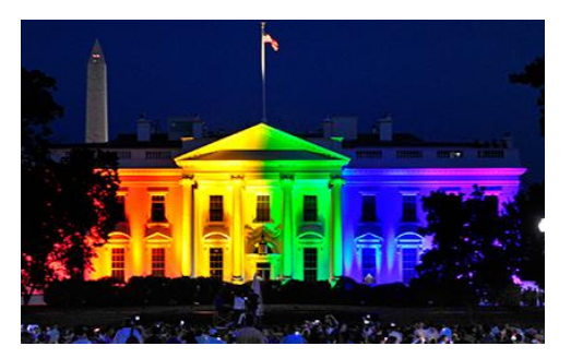
Page 18 of 20