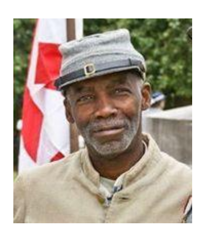
FB Image HK Edgerton

Sir, we are confused by what we see. You are a African American standing on the side of the road with the Rebel flag. At the point of entry, we were told that here in the South that African Americans don't like the Confederate flag, and that they are responsible for the tearing down of the Confederate soldier's monuments.