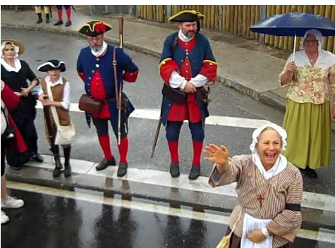
together.

was well attended and enjoyed by both participants and observers. True, umbrellas were necessary. However, the Christmas spirit prevailed.