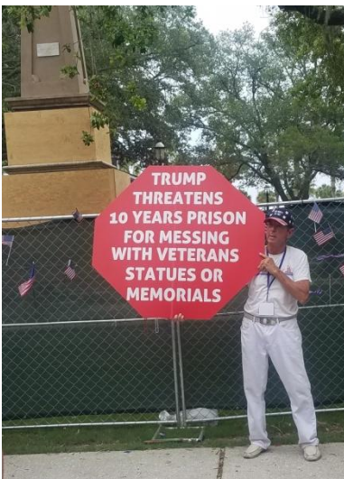
TCCR Staff Photo

However, it was observed that many individuals and groups, who have been waging this campaign for the past three years, were also present.