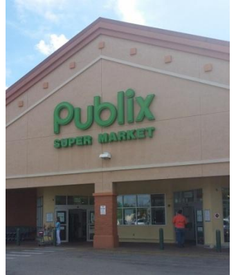
TCCR Staff Photo

“Are there fines in Florida for not wearing a mask? We'd have to have a flash mob of Conservatives go into Publix wearing masks, and a whistle to then yank the masks off all at once. We'd have to have 50 to 100 people all committed to be in on it, to underline the point in a big way, too many to arrest. Perhaps after the masks came off, two minutes later, at another whistle, we could all put the masks back on and leave the store, before the cops showed up. Maybe this would inspire more - similar and different - protests around the country. We just have to grow some guts and find our moment. The pioneers take the arrows, as Rush says. Call them Pushback Events! I've been thinking a long time how we can do a pushback against the Left without going to court, or jail, or both. Where do any public officials or CEOs of companies get the authority to tell people that wearing masks is mandatory? From Fauci? Screw Fauci! However, getting Conservatives together to do anything is like herding cats. Maybe that will be different if Trump loses. Of course, if Trump loses then the Left will run wild over the Right. Maybe that's what it will take to force the Right to get organized and fight. If the Left gets control, maybe the Right will consent to drag their feet so much that the Left will find the country ungovernable, like how Poland got rid of the Soviets, or like how Gandhi got rid of the Brits. The Right would be loath to jump up and actually have a shooting war with the Left.”