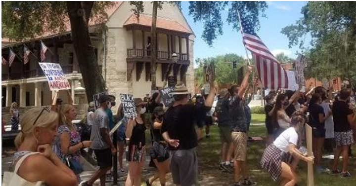
TCCR Staff Photo

The demonstration on the 26 th of July, however, was different than the previous appearances because another group was also present.