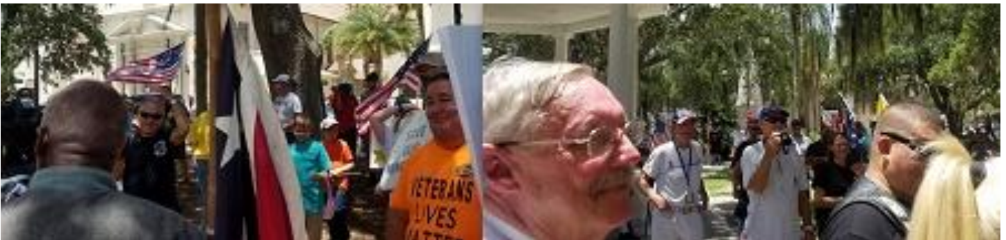
TCCR Staff Photos

On July 18, 2020, in the Plaza De La Constitucion, an impressive number of people assembled to show their displeasure with the willful destruction of Historical Monuments. The event was organized by a group known as "Defend St. Augustine".